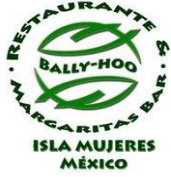
Bally Hoo – great food and nice atmosphere