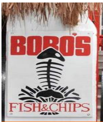
Bobo's Fish and Chips at its finest