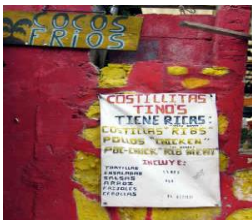
Tino's the Rib Guy – normally open on weekends but delicious