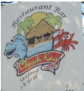
Chuuk Kay – Excellent food nice band Thursday thru Sunday