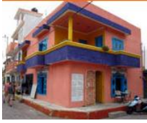
Café Cito – great place for American bacon and eggs