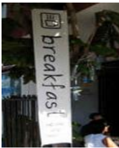
Elements of the Island - really healthy food can't go wrong