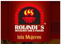
Rolandi's pizza – also great pasta try the Rolandi Salsa pasta special yum-mo