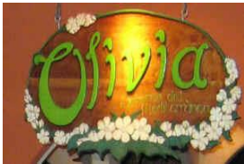
Olivia's – Mediterranean style food – yummy baklava