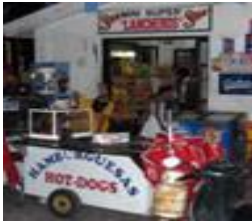
Hotdog carts —the bacon wrapped hotdogs cannot be beat