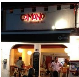
CoMoNo's - mid-eastern cuisine – great humus