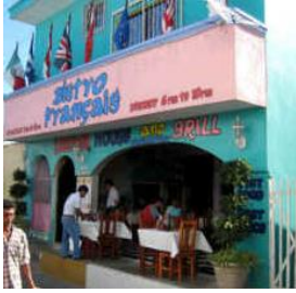
Bistro Francais – good steaks and lobster dinner