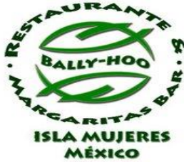
Bally Hoo – great fish tacos and margaritas