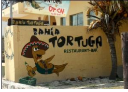
Bahia Tortuga – great food - great atmosphere – fantastic drinks